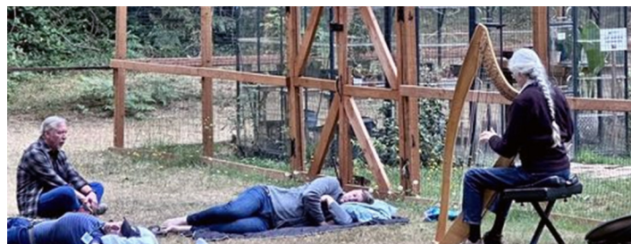
Pilgrim Firs work camp, rainbow over labyrinth and harp retreat.